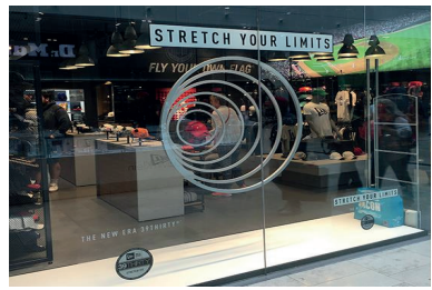
Westfield 3D window display