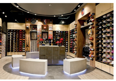
New Era Frankfurt store fitout